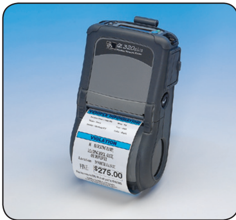
QL 320 Plus™

Zebra's popular QL 320 Plus mobile printer, for print widths up to 3 inches, was the first to offer the flexibility of 802.11b/g radio modules to meet evolving needs and wireless standards. Count on its durable design to endure tough manufacturing or shipping/receiving environments.