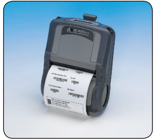
QL 420 Plus™

Bring the flexibility of wireless printing to your 4-inch label or receipt applications with Zebra's QL 420 Plus mobile printer. Built to survive the rigors of warehousing, distribution, and route accounting, the QL 420 Plus offers a mobile mount option to allow printing in a forklift or vehicle.