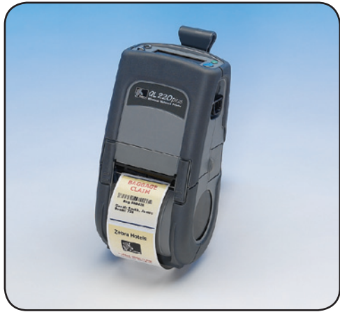
QL 220 Plus™

Take 2-inch label, ticket, and receipt printing where stationary and larger mobile printers dare not go—whether it's down store aisles, on hospital rounds, or onto retail pharmacy counters. Strap or clip on the sleek, 1.04-pound QL 220 Plus network-addressable label/receipt mobile printer and move with ease!